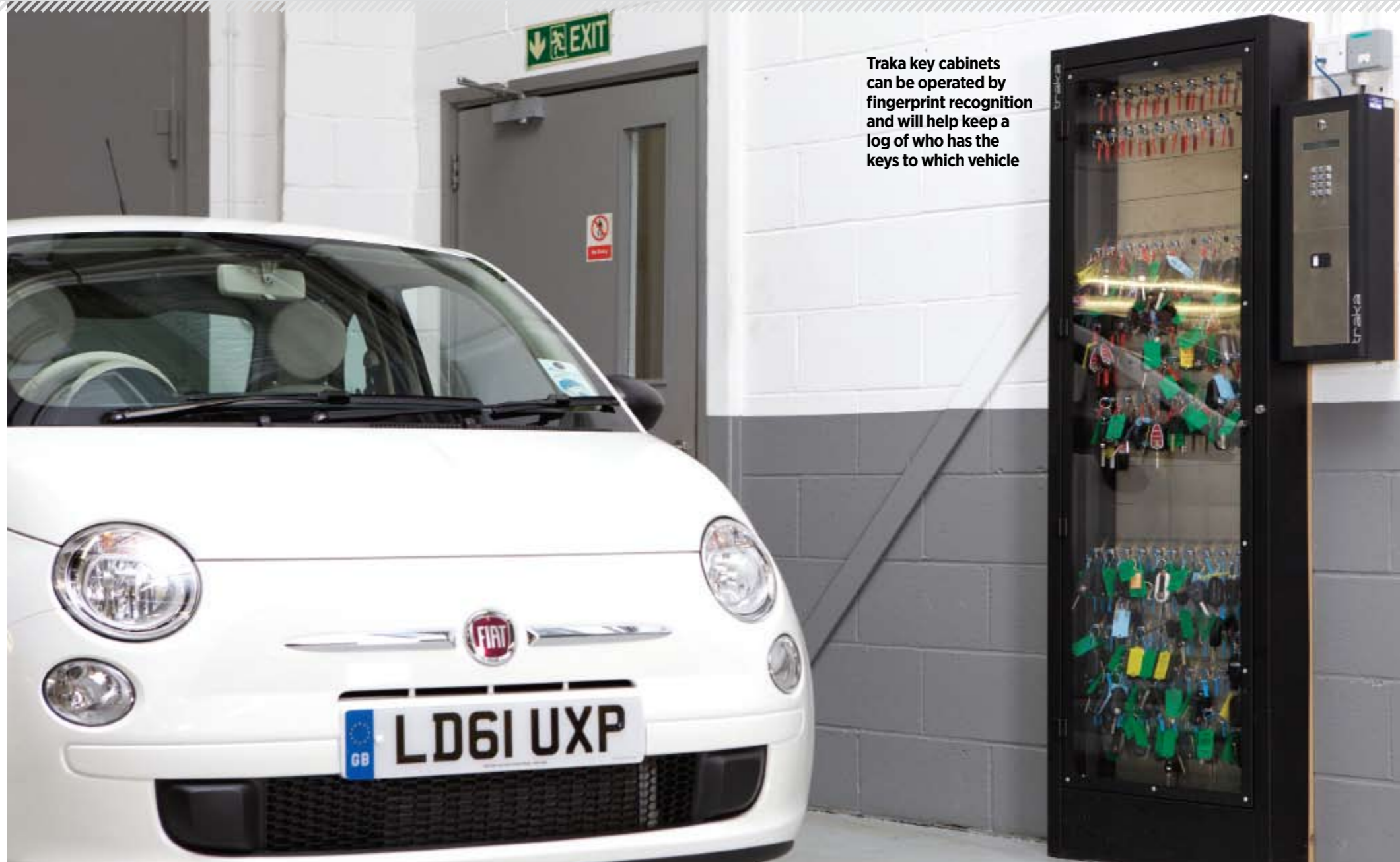
Traka key cabinets can be operated by fingerprint recognition and will help keep a log of who has the keys to which vehicle

'For instance you might be a small to mid-sized dealership in London and you could have