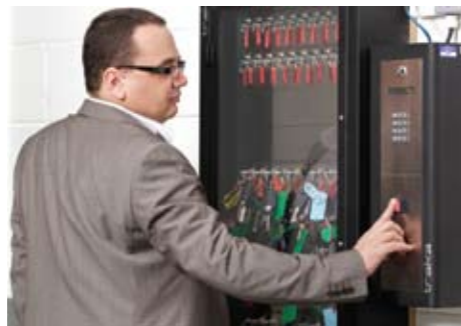
Fingerprint recognition releases keys