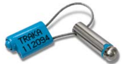
Very Clever Key

Traka's iFob can be securely attached to your conventional keys and key sets. This allows them to be controlled via our intelligent Key Cabinets, and enables you to efficiently manage and audit the usage of a wide range of assets and facilities.